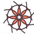
Tasman Peninsula Marine Protection